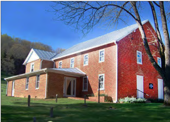
Neriah Baptist Church, in the South River community between Lexington and Buena Vista.