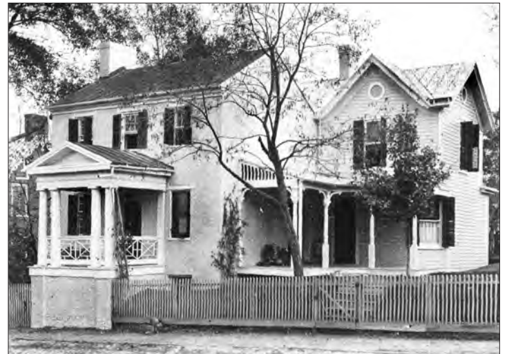
Built as a residence in 1822, this building on South Main Street was the Rockbridge library building, 1961–86.