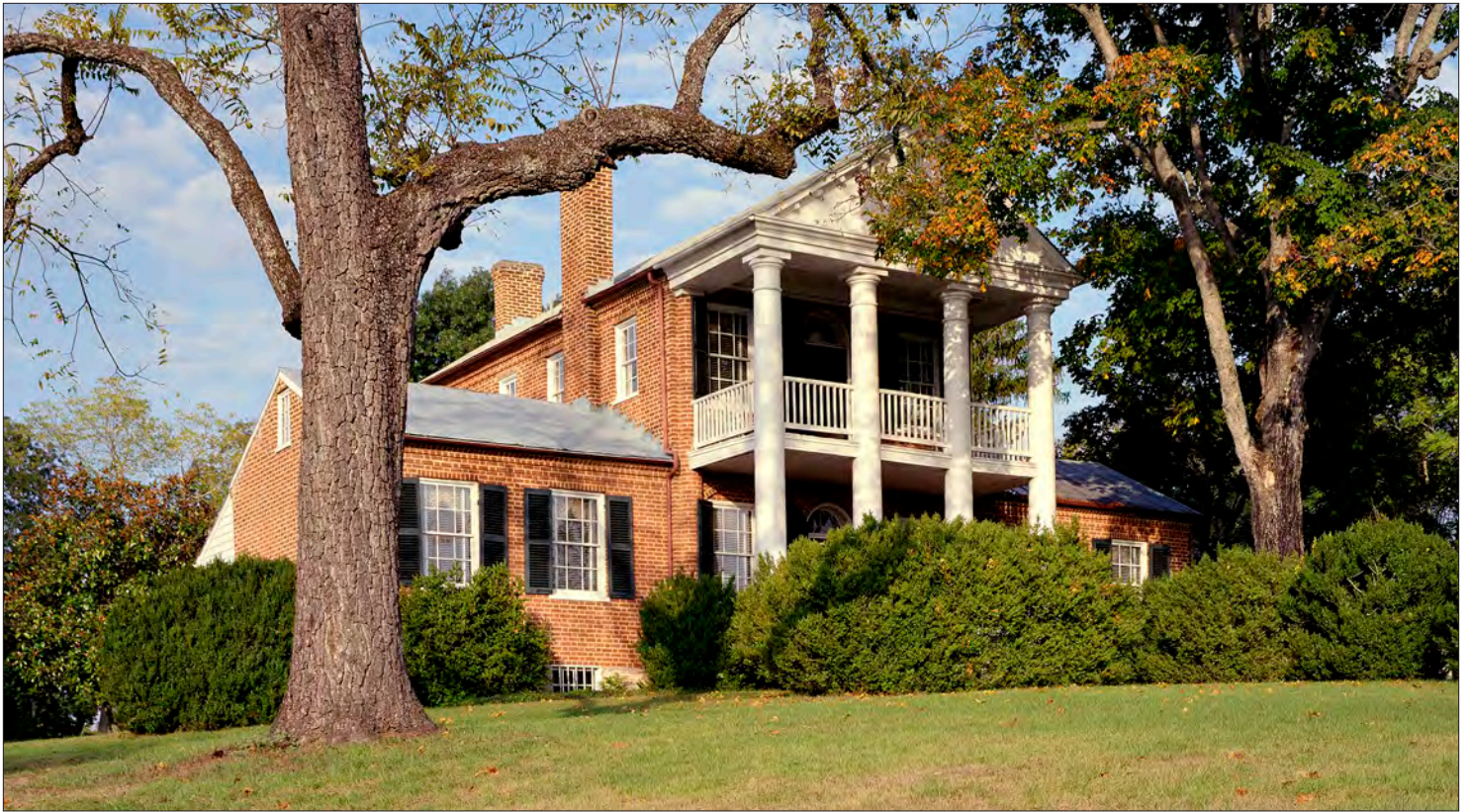
Stono today.

first buildings west of the Blue Ridge Mountains to be in a temple form with a two-story portico. 19 Stono follows a three-part Palladian scheme, with a “colossal Roman Doric portico” which the Report for the U.S. Interior Department’s Register of National Historic Places cites as reminiscent of Thomas Jefferson’s style. 20 The original portion of the house has a two-story central section and two one-story side wings. The front portico has a modillioned pediment, and the portico columns are “thin and closely spaced.” 21 The front door and the porch door