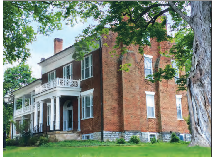
Stylistically, the Charles P. Dorman House, left, more familiarly known as the Rectory, and the next-door Reid-White House, right, have more in common with each other than either has with the Pines or Beaumont, their Lee Avenue neighbors to the south.

Institute. 24 He wrote a letter in January 1818 that noted the great care he had taken in molding the bricks, saying that there were more hand-made bricks than would usually be the case. 25