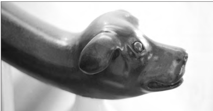
Stono’s dog’s head newel post.

“Little Stono,” about three miles outside the town of Lexington, believed to have been built in 1816, is also